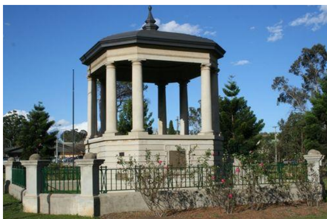
St. Marys War Memorial